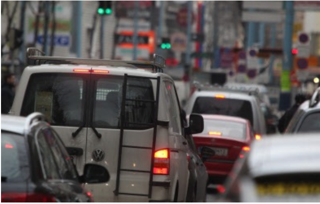
Fig.3.: Mariahilferstraße 2012