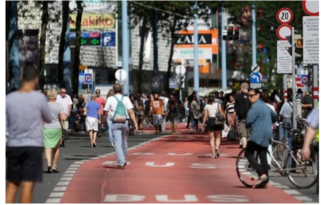
Fig.4.: Mariahilferstraße 2014

processes of transformation. Indeed, the pedestrianisation of these 'zentral öffentliche Räume' provoke widespread attention because of their high visibility within Vienna's public places hierarchy. In Paris, we can first single out the construction 1971-1977 on the empty Plateau Beaubourg of the world renowned Centre Georges Pompidou including its pedestrianised surrounding, and on the other the partial pedestrianisation of the nationally famous Place de la République.