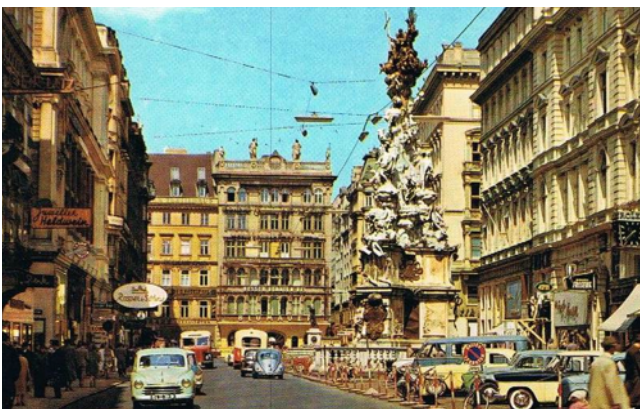
Fig.1.: Graben 1970

Pedestrianised streets and urban gardening are ideal-typical of the investment made by their producers to promote concerns about the built environment on the one hand and the natural environment on the other hand. In Vienna, the pedestrianisation of the Kärtner Strasse-Graben in 1974 and 2014 of the Mariahilfer Strasse are two good examples occurring at different times but undergone by the same