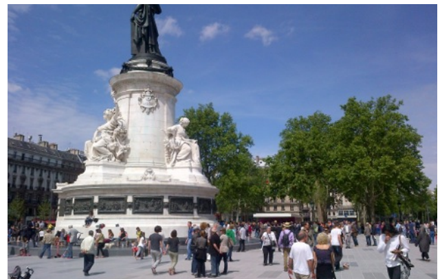
Fig.8.: Place de la République 2014

More marginal—spatially and in the media—yet equally relevant, we can cite in Vienna the experiences led by “selbsternte.at” who provides land plots for rent and self-harvest in the periphery of the city, and “Guerilla Gardening” actions in more central places. In Paris, the growing trend of “jardins