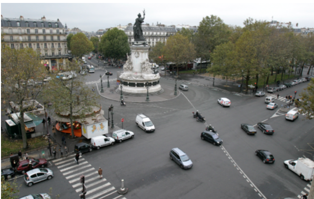
Fig.7.: Place de la République 2011