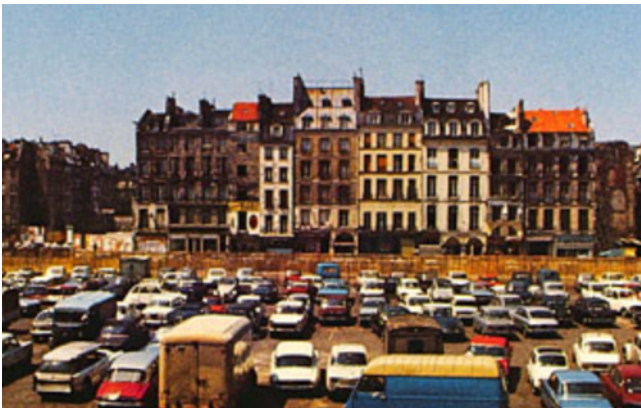
Fig.5.: Plateau Beaubourg 1971

processes of transformation. Indeed, the pedestrianisation of these 'zentral öffentliche Räume' provoke widespread attention because of their high visibility within Vienna's public places hierarchy. In Paris, we can first single out the construction 1971-1977 on the empty Plateau Beaubourg of the world renowned Centre Georges Pompidou including its pedestrianised surrounding, and on the other the partial pedestrianisation of the nationally famous Place de la République.