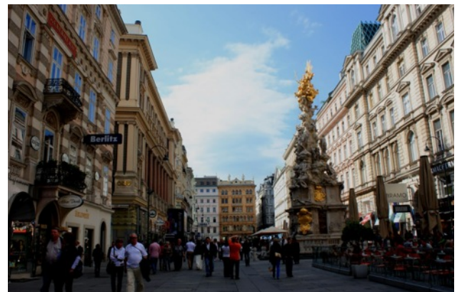
Fig.2.: Graben 2014