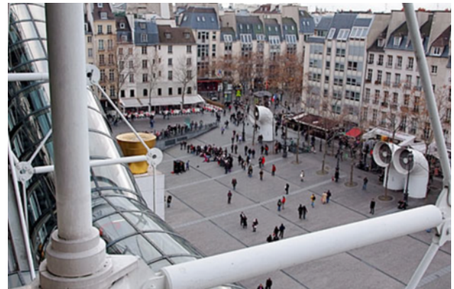
Fig.6.: Centre Georges Pompidou 2009